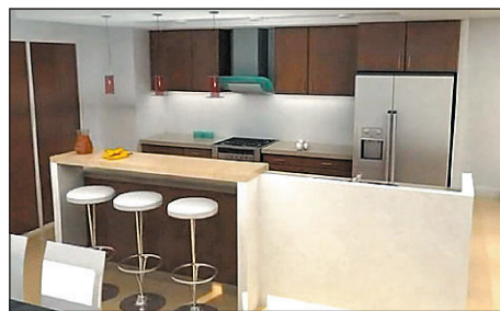
The kitchen has a galley-style design

Modern lines give the Blue Berry its street appeal