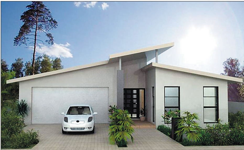
• Artist's impressions

For more information call 1300 294 663 or go to www.bluewoodhomes.com.au