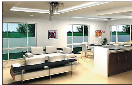
Living areas are open plan